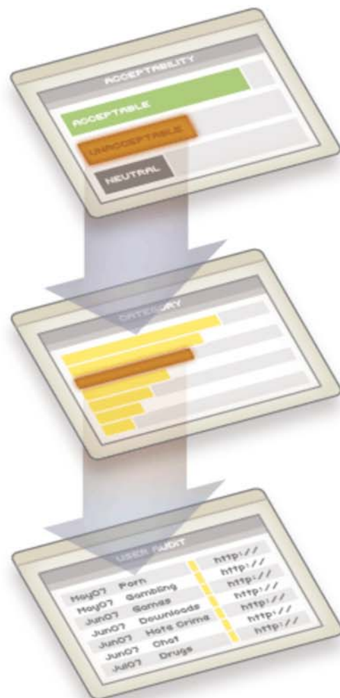
Interactive Drill-Down Reporting